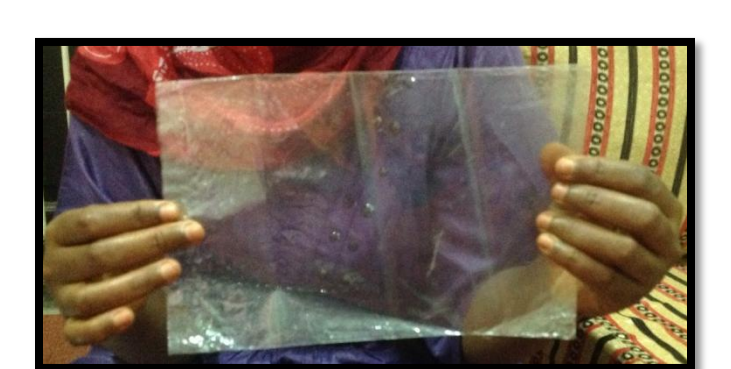
A true work of art!

Now a day's most henna artists around the world prefer to use the cone or tubes of henna. Cones are made using plastic paper with scotch-tape to bind the paste into a cone shape with a hole at the end. In the same way you would frost icing on a cake, henna is decorated directly on to the applicant's body with only the artist's imagination of the finished product.