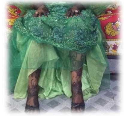
Swahili Bride decorated with henna